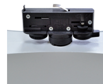
Dettaglio adattatore trifase 3 phase adapter detail